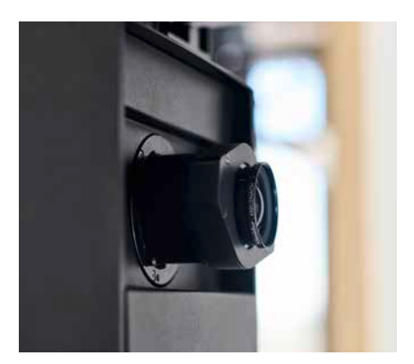
Optional: optical zoom

Fulfills ISO 19264 / Quality Level A, Full Metamorfoze and FADGI****