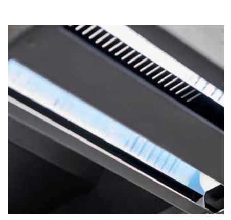
LED lighting system for reflection-free and shadow-free results