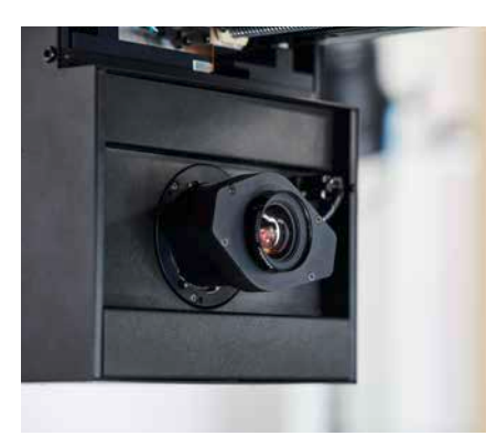
Completely new developed camera system based on a CMOS sensor